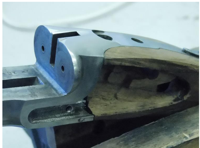
One hundred sixteen hours later