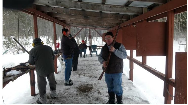
Having fun on the muzzleloader range

Well the Frostbite Shoot was true to its name; it was cold and windy but we shot anyway. No injuries and or incidence reports needed and only one vehicle got stuck in the snow.