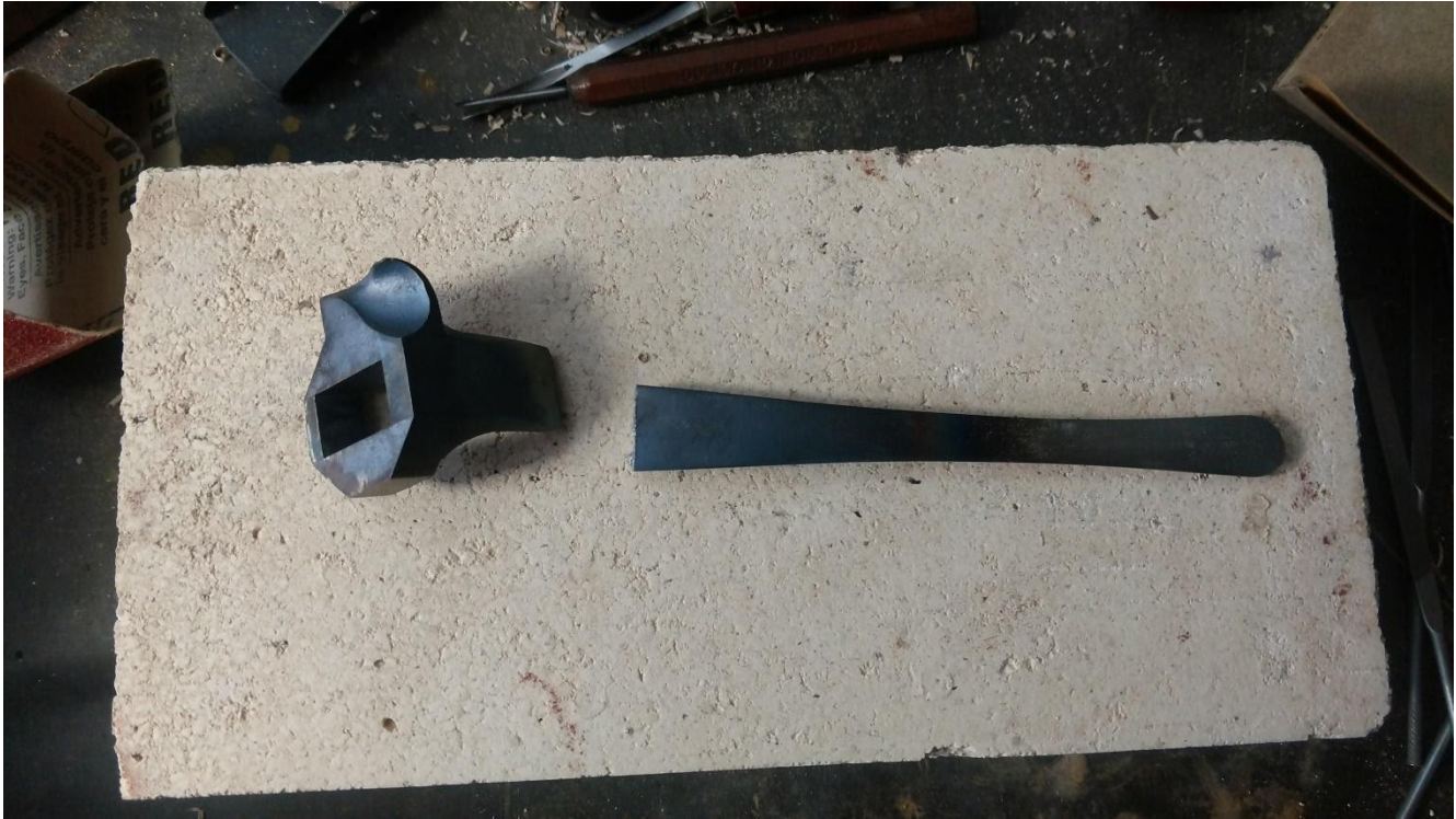
Tang for a hooked breach (it's supposed to be one piece)

Here is the reason why one shouldn't be in a hurry when building a muzzleloader.