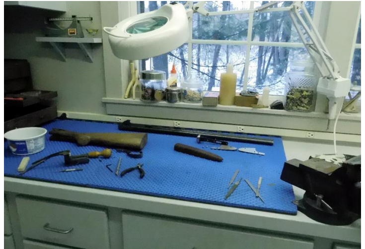
The action has taken a quite a beating over the years so it needs polishing before inleting into the stock.