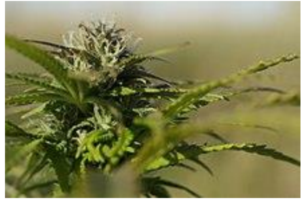
Cannabis, aka Marijuana

This "drug" is now legal for recreational use in our state. There is much debate about whether it should or shouldn't be. But, the law is what it is. Our club however can and should impose our own rules governing its use prior to and during any club function especially when one is engaged in shooting. Below are some of the reasons why.